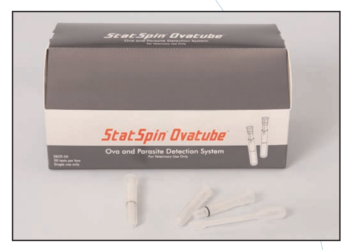
StatSpin OvaTube Kit