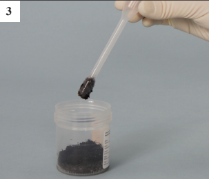
Push Mixer into faecal sample and transfer to the Tube.