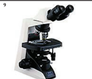
After 3 minutes, transfer coverslip to slide and examine under microscope.