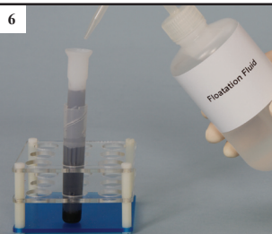
Add floatation fluid to fill line Click Here For Details.