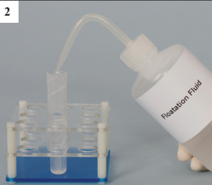
Add floatation fluid to the fill line.