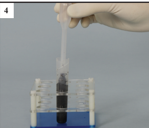
Turn Mixer back and forth and gently squeeze bulb to mix sample. Discard Mixer.