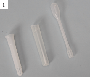
OvaTube® – Tube, Mixer, and Filter

Click Here For More Information About OvaTube