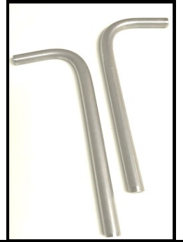
Rotor Removal Tool Set

Please contact Technical Services: 01798 874871 If you have any Questions