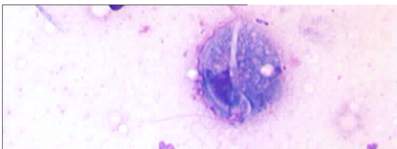
Fig1. Diff-quick-stained faecal smear showing Tritrichomonas foetus tachyzoite

The parasite targets the large bowel, colonising the ileum, caecum and colon, where it can cause lymphocytic, plasmacytic inflammation and chronic diarrhoea. Clinical signs range from asymptomatic to severe intractable diarrhoea, which can be foul-smelling and is characterised by the frequent passage of small quantities of liquid to semi-formed faeces often with blood, mucus and straining. Anal irritation may also be a feature, and in severe cases cats may develop faecal incontinence. Despite the presence of severe diarrhoea, most cats do not lose weight as it is primarily the large intestine that is affected. Indeed most cats with TF infection are not systemically ill, so if this is present it is important to look for other underlying diseases.