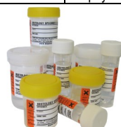
Histology Pots, Pre-filled & Empty & Biopsy Cassettes